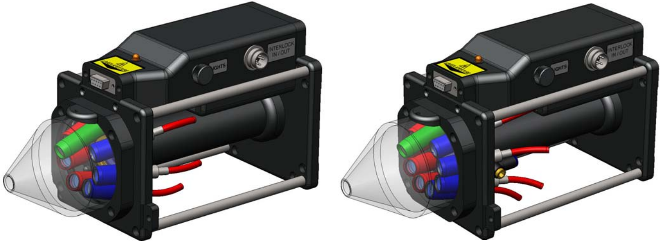
LIBS-6 module (left) and LIBS-8 module (right) illustrated with optional imaging camera (green tubular housing)

Integrated optical modules for configuring customised LIBS systems from a range of pulsed lasers and UV-Vis-NIR spectrometers